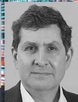
Christian Bellini Blackwell Structural Engineers